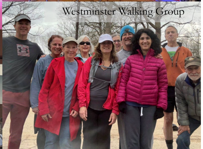
Westminster Walking Group