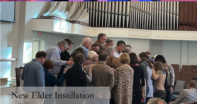
New Elder Instillation