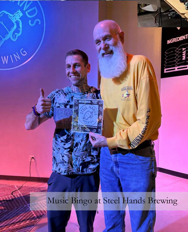
Music Bingo at Steel Hands Brewing