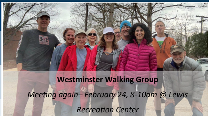
Westminster Walking Group