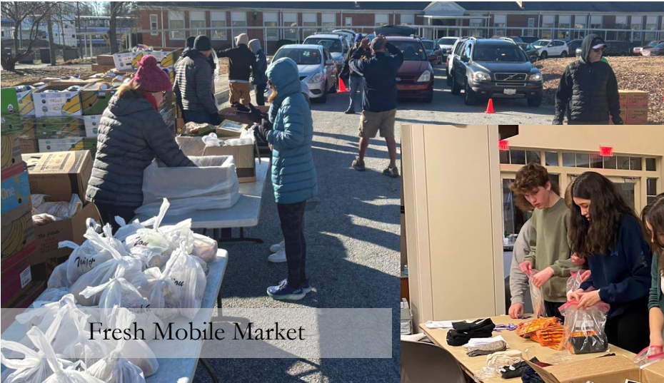
Fresh Mobile Market