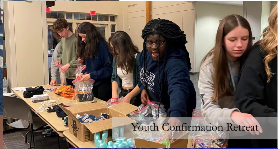
Youth Confirmation Retreat