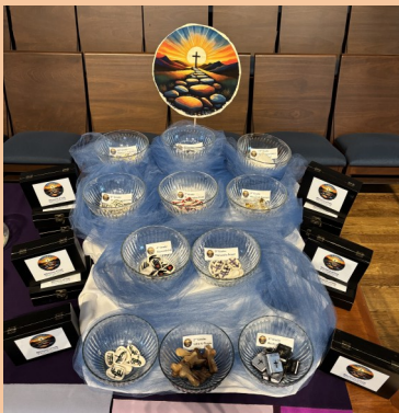
Milestones of Faith tokens displayed in the sanctuary, marking each stage of our children's and youth's journey of faith.

If your child is not able to attend Milestones of Faith Celebration Sunday, stand alone lessons will be available to each family who would like to work on the milestone with their child. They will have around one month to complete the lesson with a parent or on their own and will be able to receive their Milestone with verification that the lesson is completed.