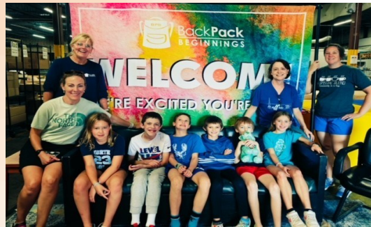
Mindy Bak captures the beauty of faith milestones:

Today, people are much less likely to return to church after an extended period away. Celebrating faith milestones can help young people, who are increasingly feeling disconnected from the church, recognize that they do belong.